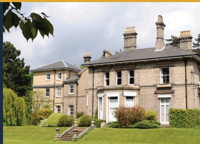
Westwood Boys' Boarding House

Westwood Boys' Boarding House is a Victorian mansion set in wooded grounds, just a 5 minute walk from the main school site. Anglesea Heights Girls' Boarding House is a modern attractive space, with ensuite facilities providing an experience similar to a university hall of residence. All of our Boarders benefit from a friendly home-from-home experience.